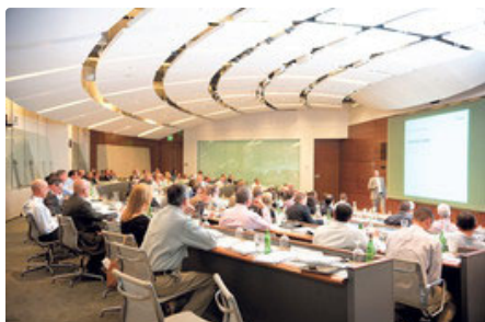
More than 100 advisors came to Dimensional's Austin, Texas, headquarters for two days of seminars.